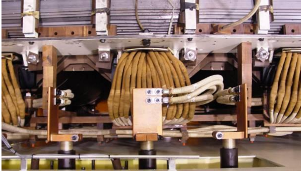
Overhead view of core & coil assembly before untanking