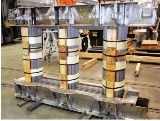
New Core and Top & Bottom Frame

7.5 MVA 69000 x 34500 – 7200/12470Y x 2400/4160Y 50% KVA Upgrade, New Core, Nomex Insulation, Disc Windings