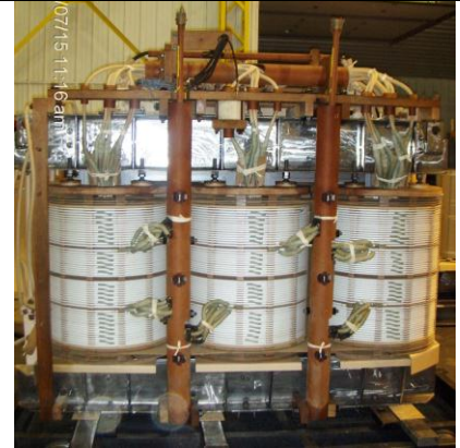
All New Core & Coil Assembly