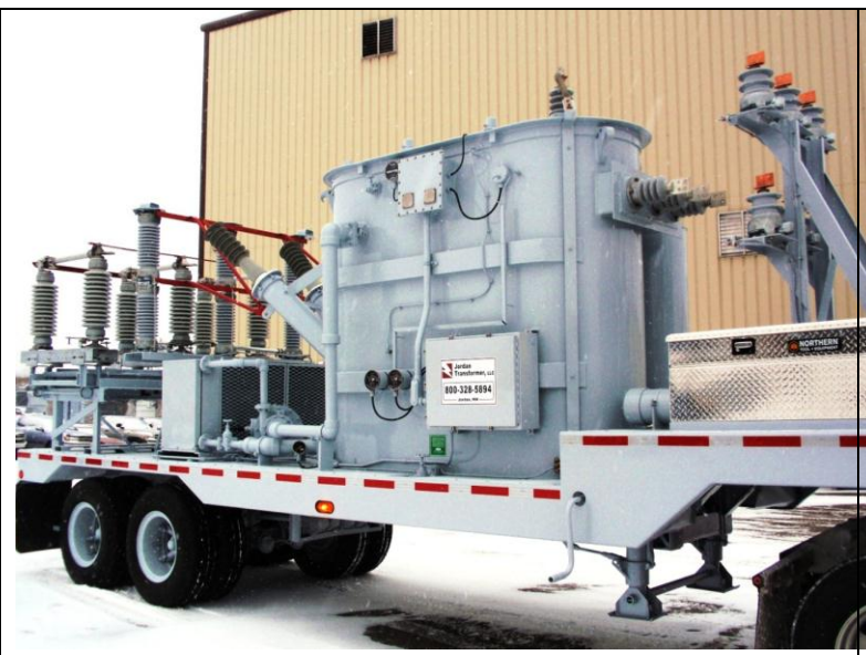
New bushings, arresters & gauges