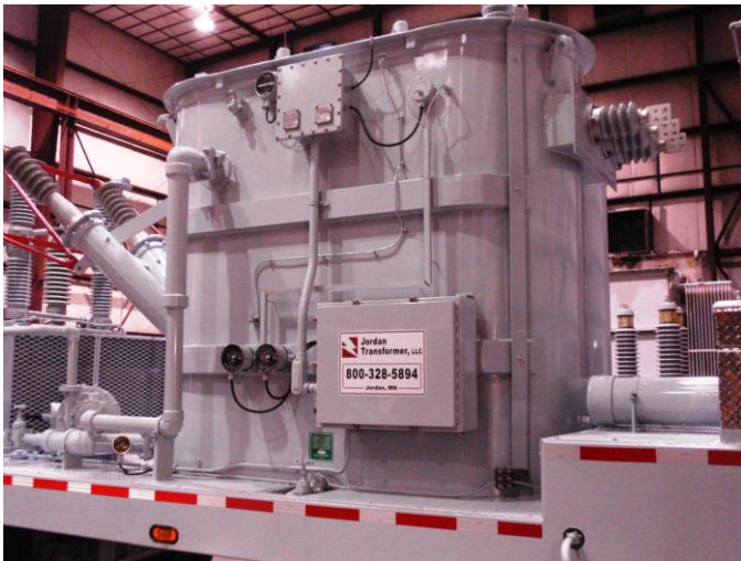
Sandblasted and Painted