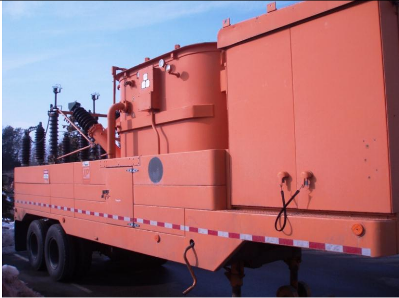
5000 KVA FOA @ 55° C. rise

5 MVA 69000 x 34500 – 7200/12470Y x 2400/4160Y GE Mobile manufactured in 1956 with layer windings