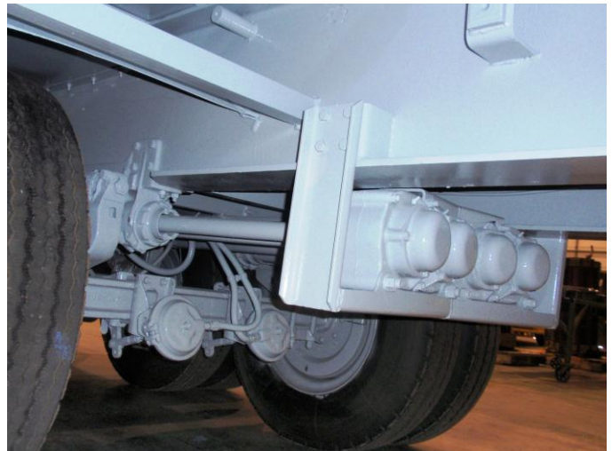
Underside of Trailer