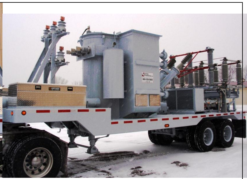
DOT Inspected, New Drawings Package