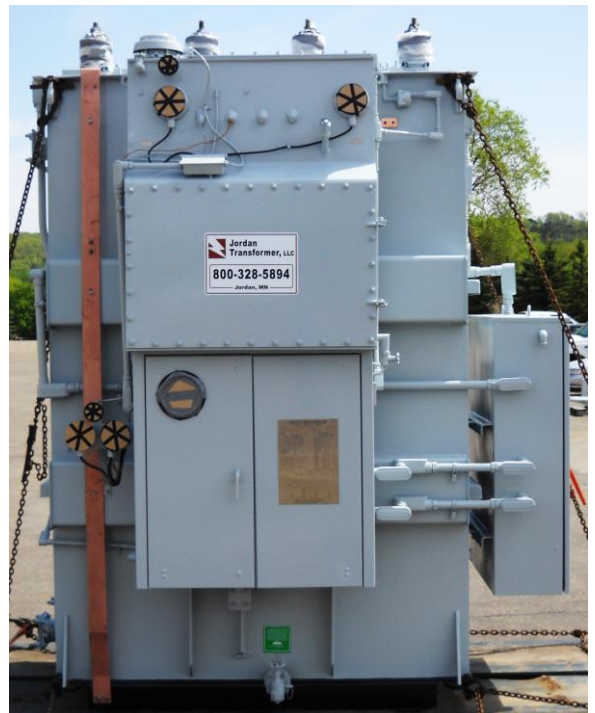
Reuse of Tank and Load Tap Changer