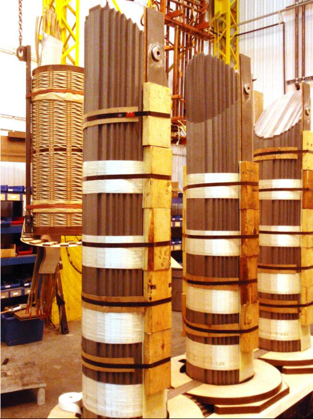
All New Core Steel