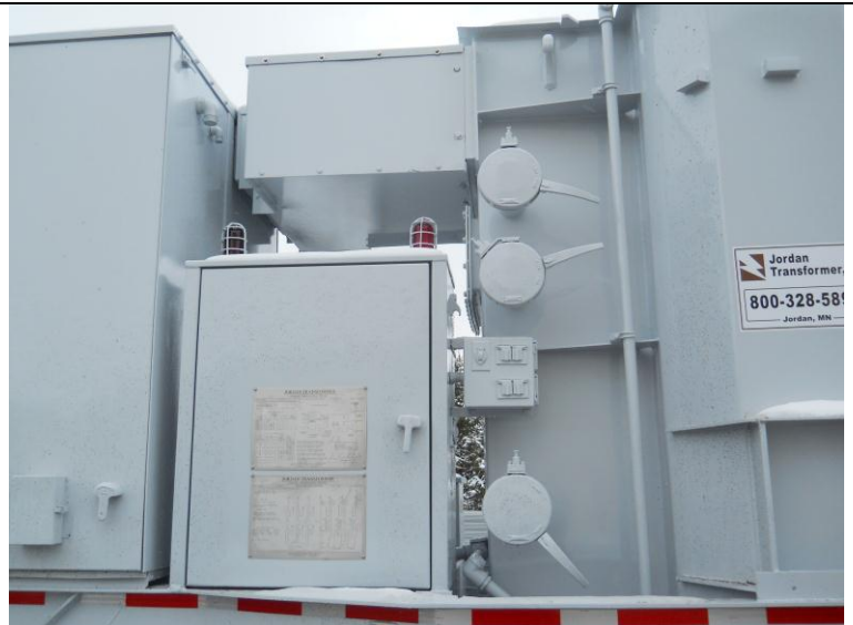
Transformer & trailer was sandblasted, painted, re-gasketed, and DOT inspected

The oil pump motor was failing & generating the acetylene. The pump was remanufactured. The core & coils were dried out and reused. Entire mobile was reconditioned and load tested to confirm the diagnosis.