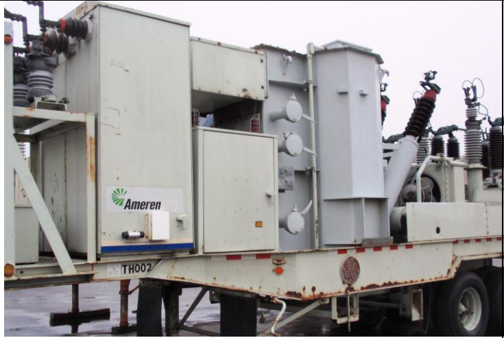
DGAs showed 128 PPM Acetylene

7.5 MVA FOA 69000 x 34500 – 7200/12470Y/7200 x 2400/4160Y/2400 GE