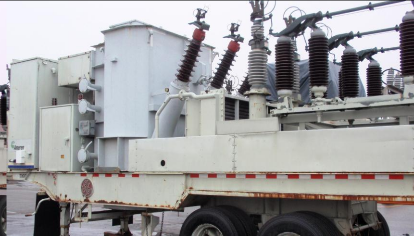
Transformer was gassing 1 PPM acetylene each day in service